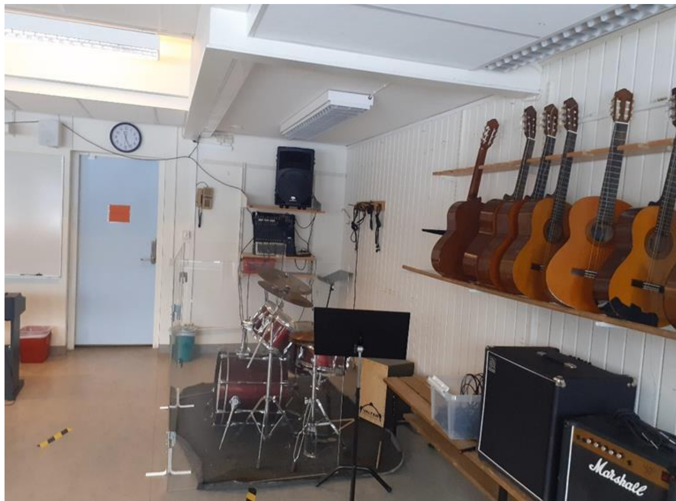
- Music class