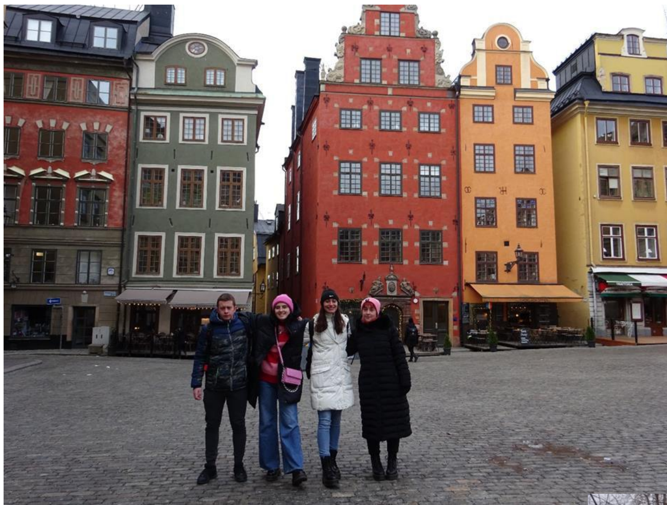
A walk in Stockholm