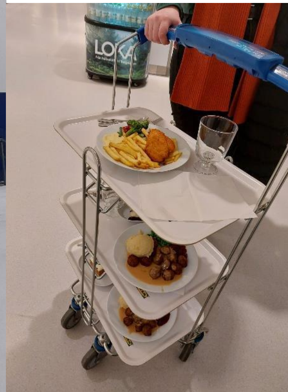
Shopping mall and Ikea