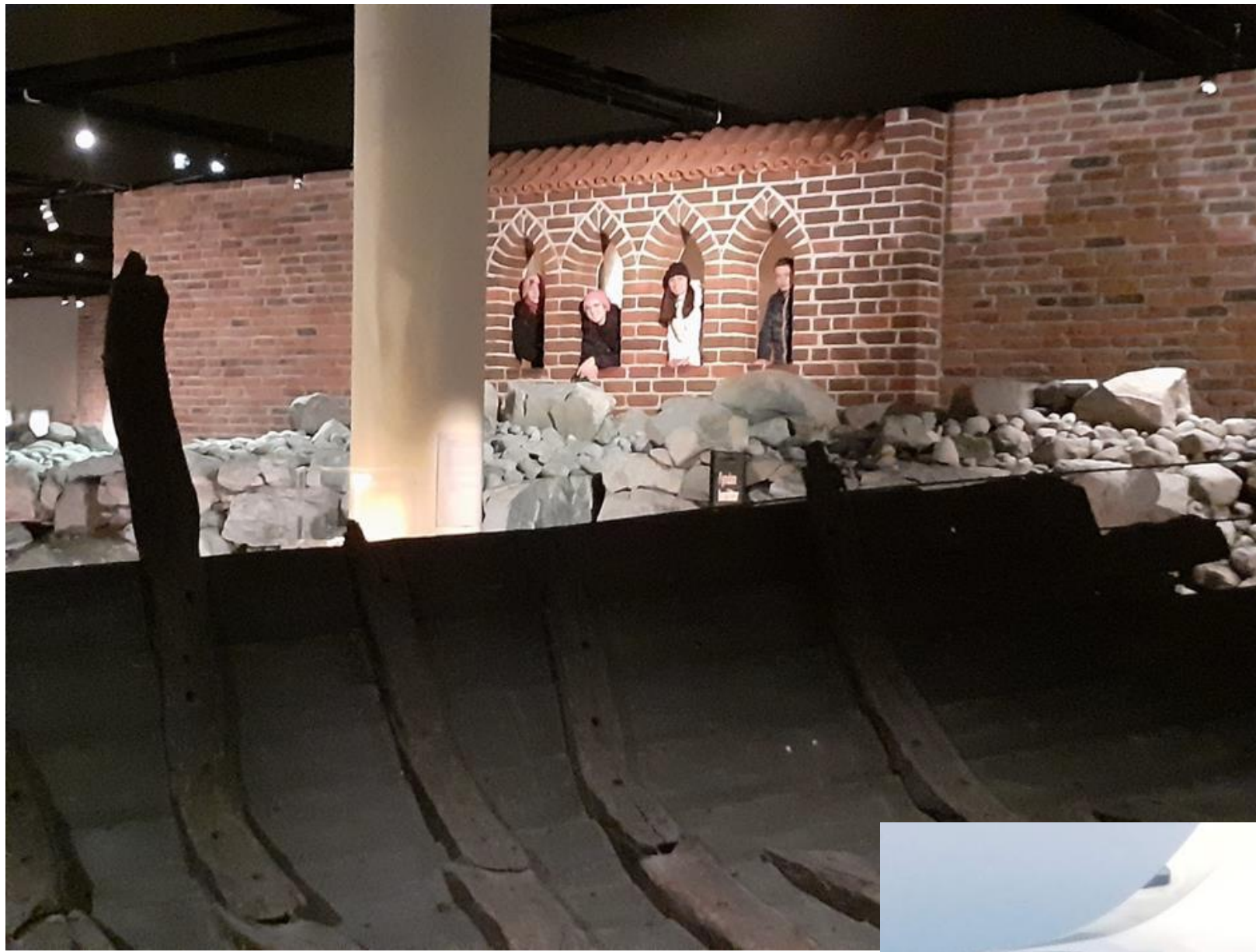
- Midieval museum