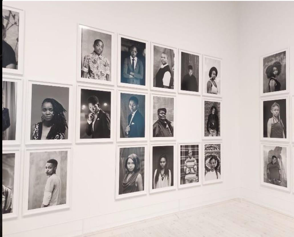
Visit to Umea museum