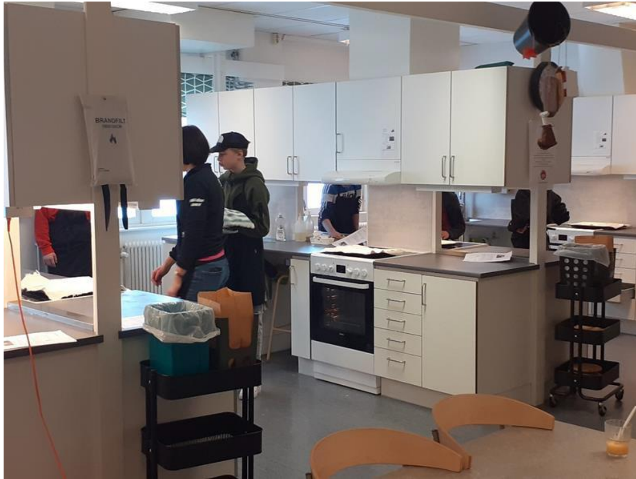
- Cooking class